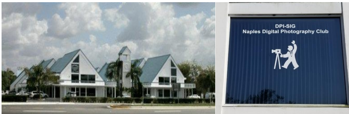
Village Falls Professional Center, DPI-SIG Training Center - 5029 Tamiami Trail East, Naples FL 34113 Across from Publix & Bank of America; LOOK AT BACK LEFT CORNER OF COMPLEX – 2 ND FLOOR.

Monday, October 31 – DPI-SIG Theater @ 6:00 p.m.